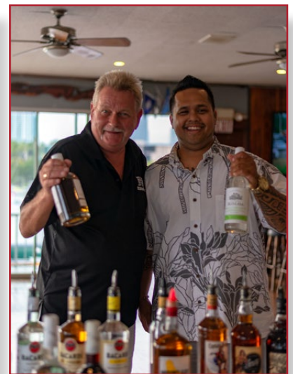
Rum Tasting Event: May 31, 2018