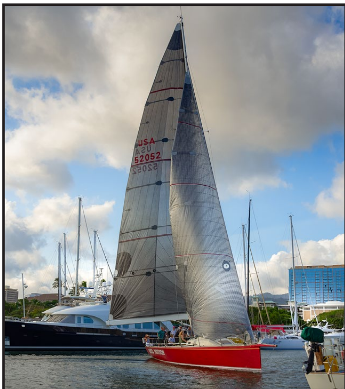
Locomotion May18 Race

M-F 8-5 • SAT 8-4 • SUN GONE FISHING PIER 38 FISHING VILLAGE (808) 537-2905 • POP-HAWAII.COM