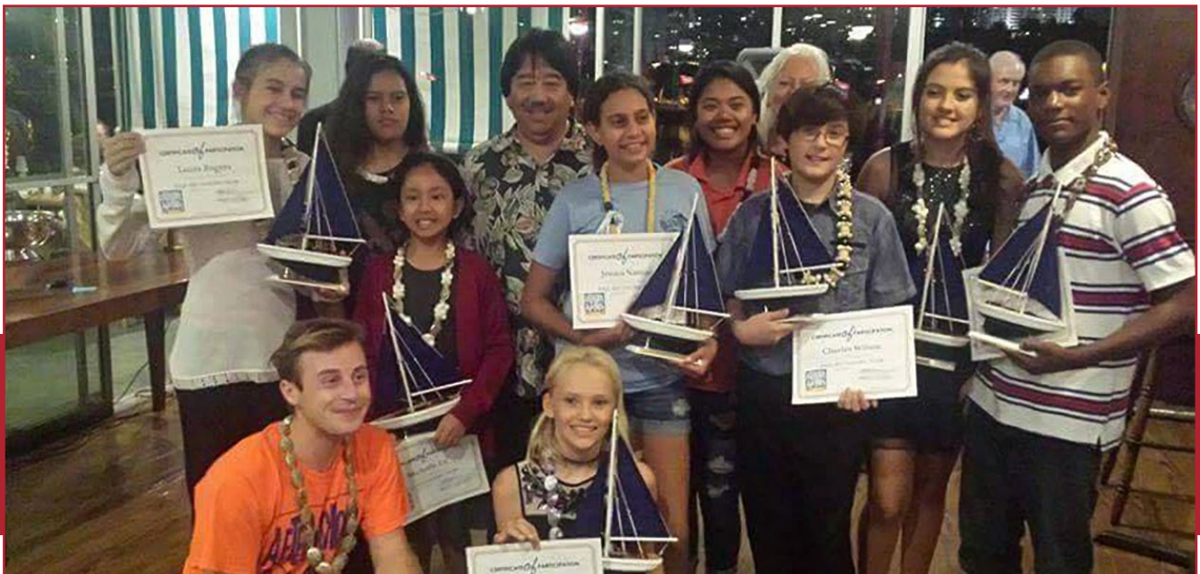
Junior Sailing Awards May 2018