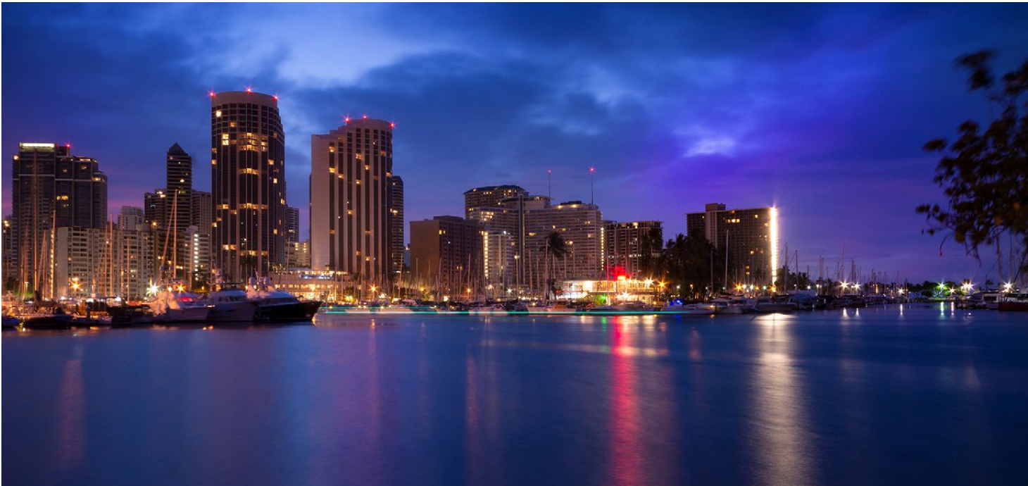
HYC, Photo credit: Carolyn Majewski