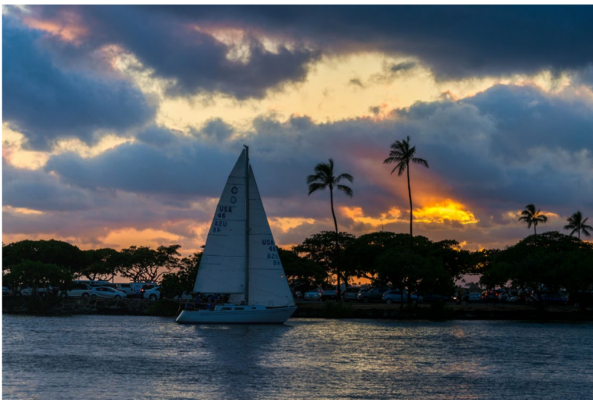
Born Free May18 Race