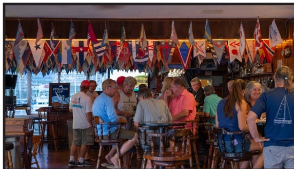
HYC -Great crowd at the bar!

Island Financial Services 350 Ward Ave. Suite 106 Honolulu, HI 96814