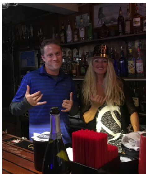
Celebrating at the bar!