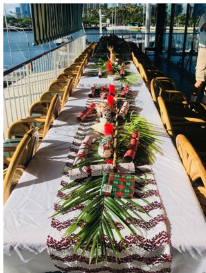
Christmas - Upper Galley